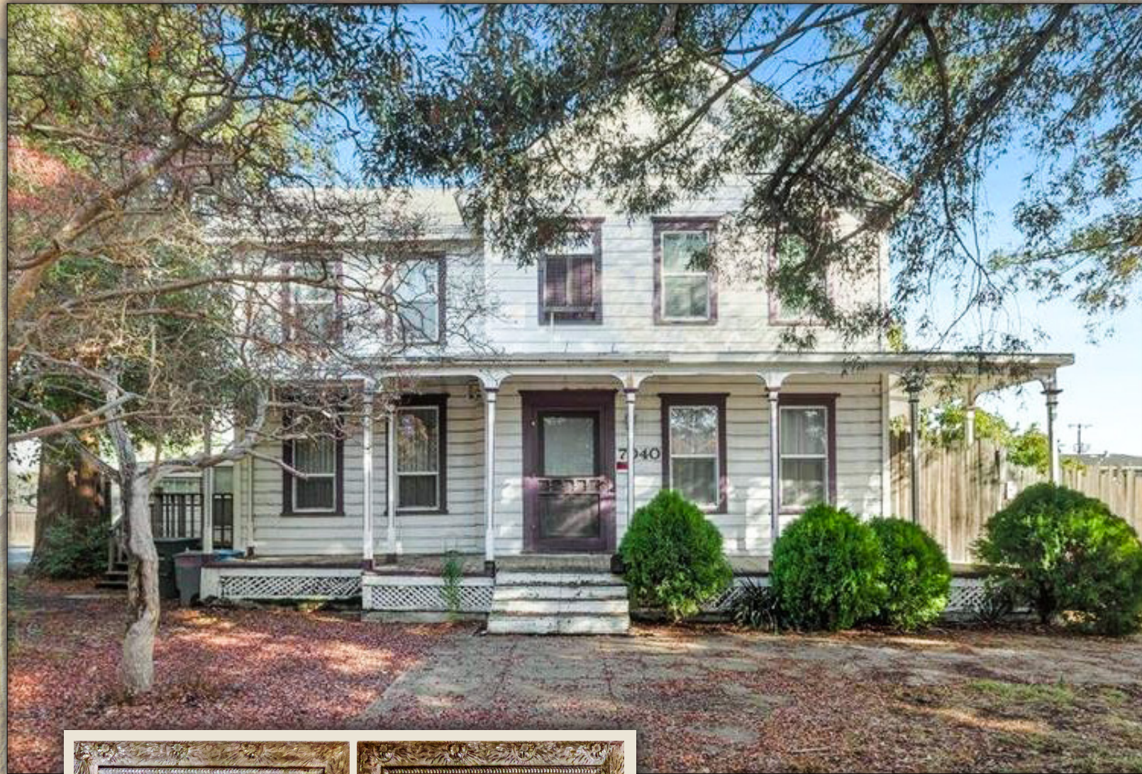
7040 Church Street