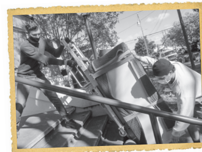
Getting a 450-pound file cabinet up the 14 Museum steps was not easy. Luckily these guys had a battery powered "crawler".

The Museum's huge file of photographs needed more space. The intrepid Susan thought we needed a new fireproof file for them and found a perfect used one in Richmond. The owner donated it and we paid a freight company to deliver it just before Thanksgiving. It was exciting to see these men bring it up the 14 steps into the Museum and put it in place!