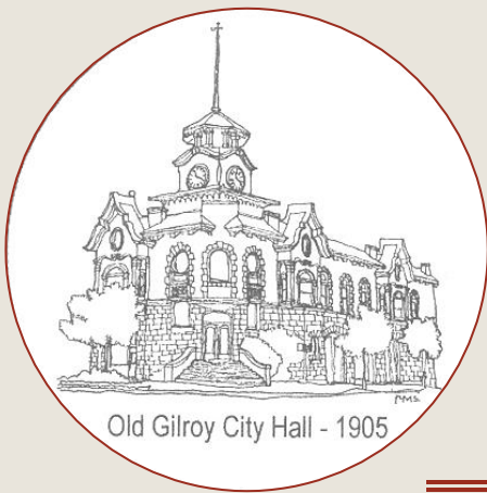
Old Gilroy City Hall - 1905