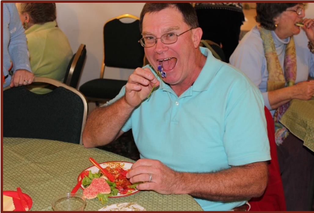
Tomfoolery at our Christmas Luncheon a few years ago.