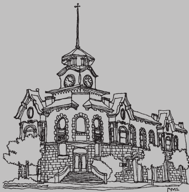
Old Gilroy City Hall - 1905