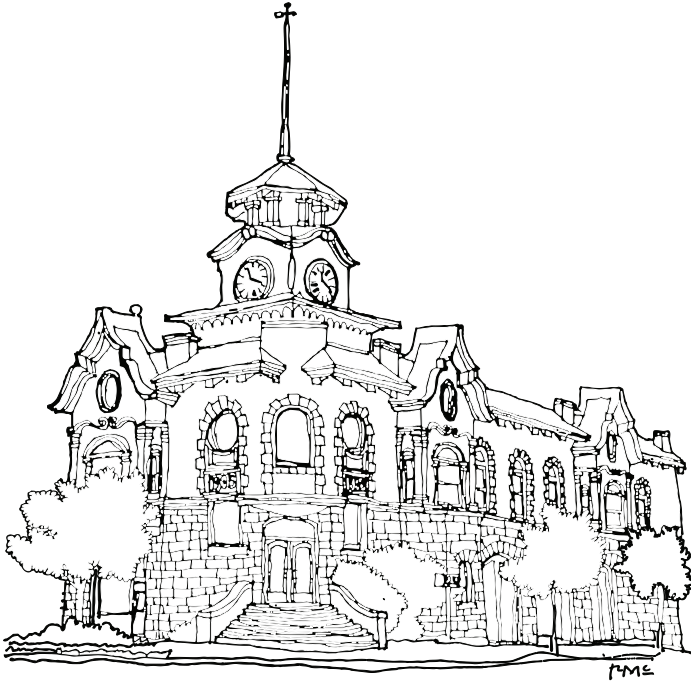
Old Gilroy City Hall (1905)