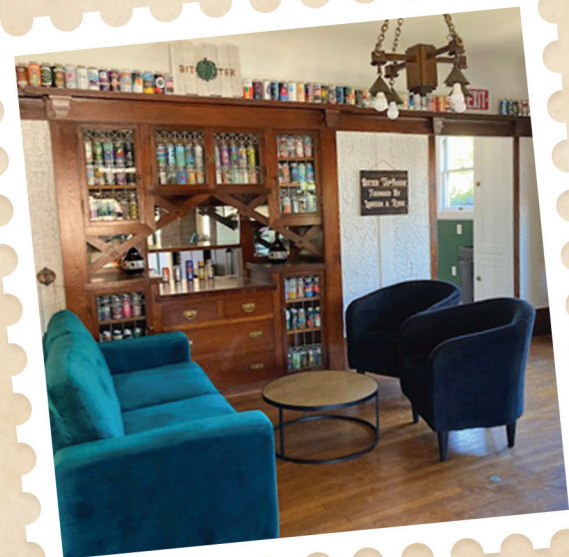
Former dining room at the Bitter Tap House.