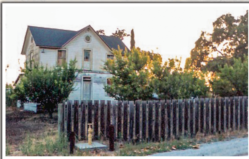
Fellom House in 1996.

But how could anyone let that happen? A four-year recovery project began that included having the entire house hydraulically lifted so that a concrete foundation could be poured to secure the house. It stands today a proud yellow farmhouse with deep roots to the past and memories of the people who were among the earliest settlers in this valley.