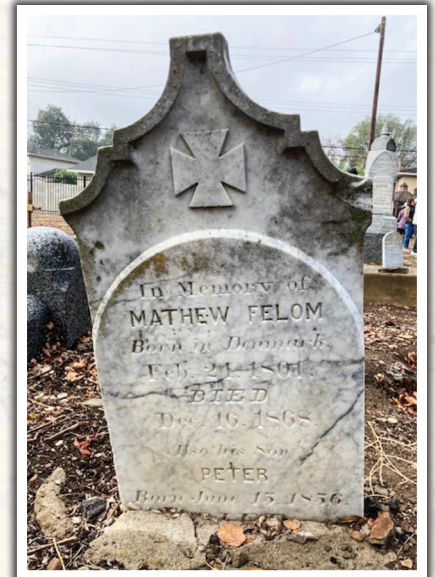
Fellom monument at Old Saint Mary Cemetery.

The very early history of this old farmhouse is discoverable. But facts get less clear and harder to pin down as years pass as is true with many stories of deaths, ghosts and family feuds. So fast forward to 1996. With the front porch fallen off and all the windows broken this once large 1861 farmhouse was beginning to lean to the south and in such disrepair that it could fall off its mudsill foundation.