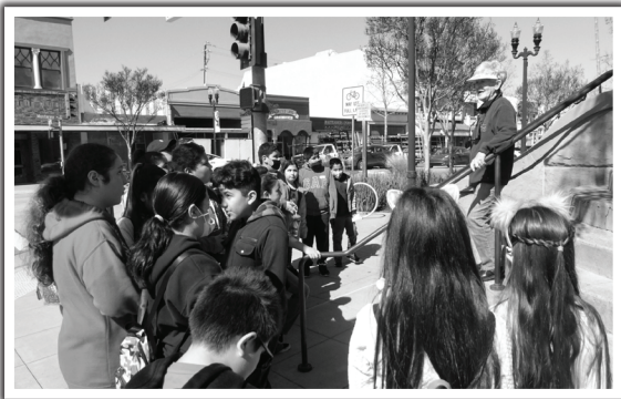
Eliot School visits Old City Hall on March 16th.