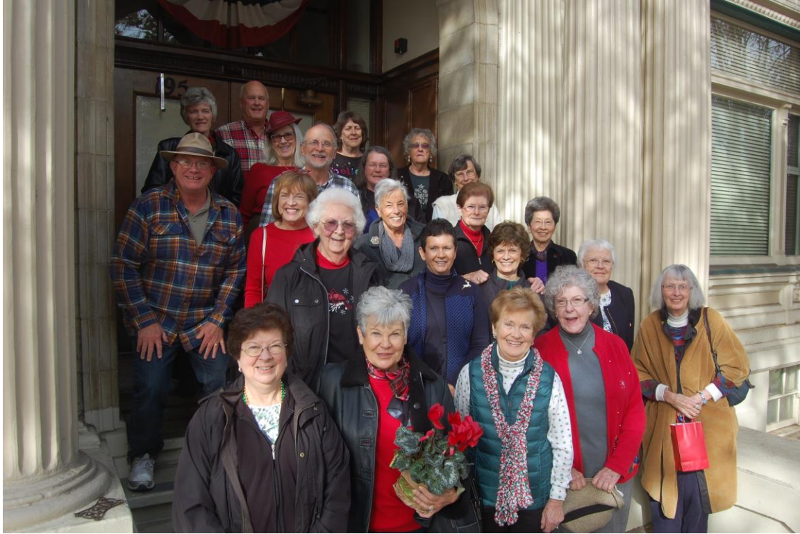
Volunteers on the steps of the Gilroy Museum