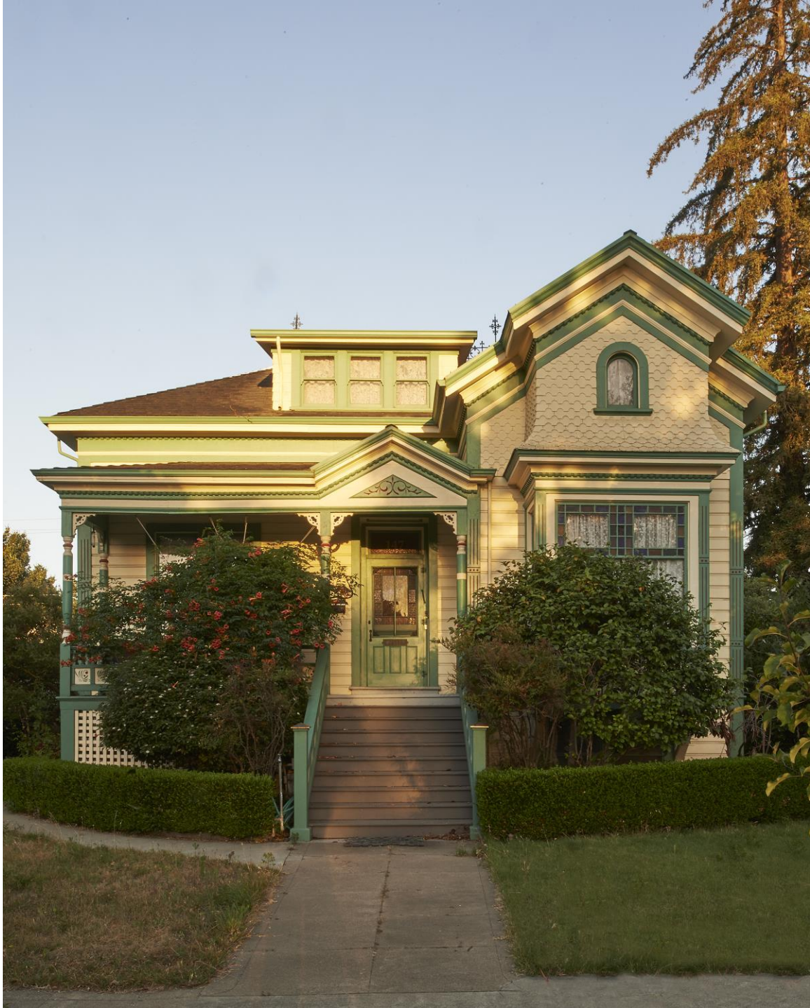
The Chesbro House, Queen Anne "cottage" 1890, 7541 Church Street