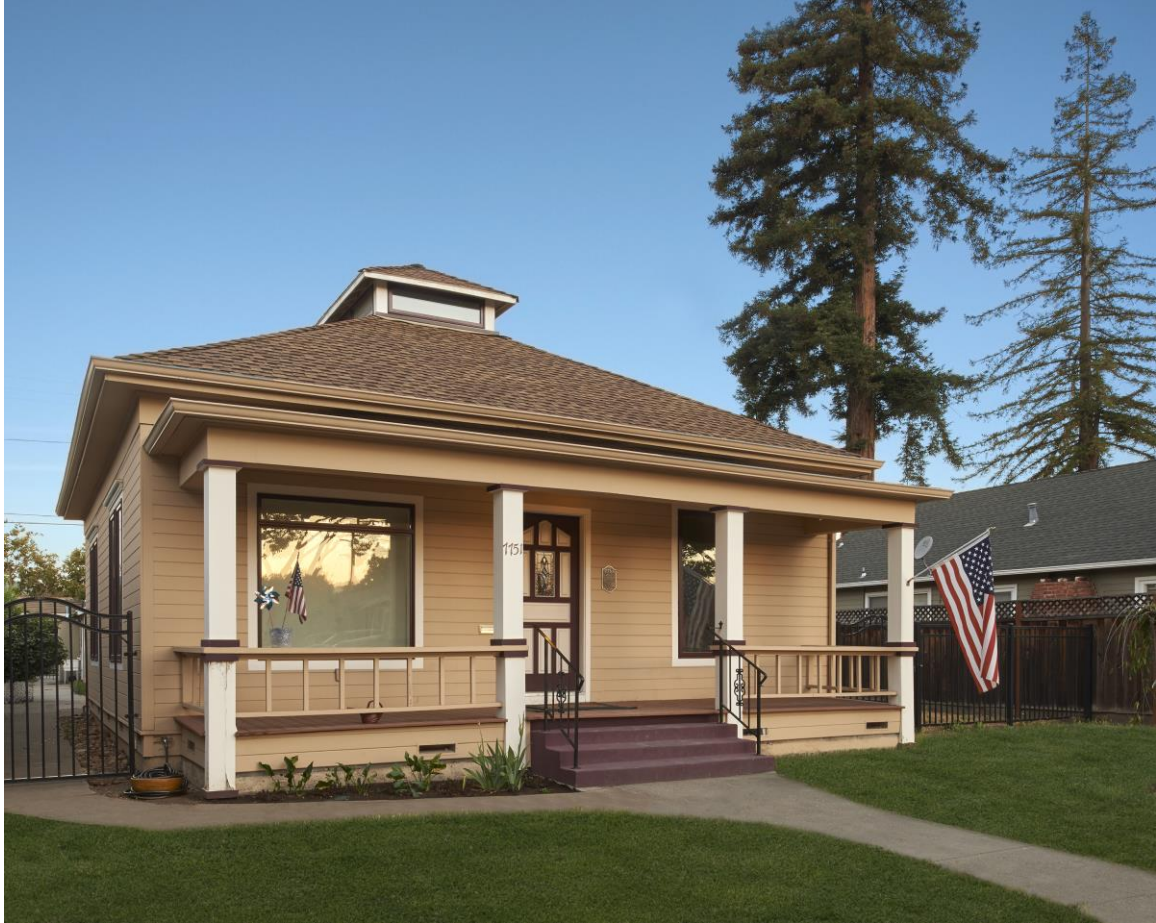
Pioneer style, circa 1885, 7751 Rosanna Street