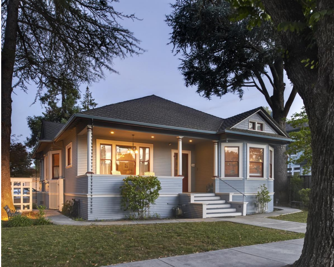
Neoclassic Row House, 1907, 366 Fifth Street