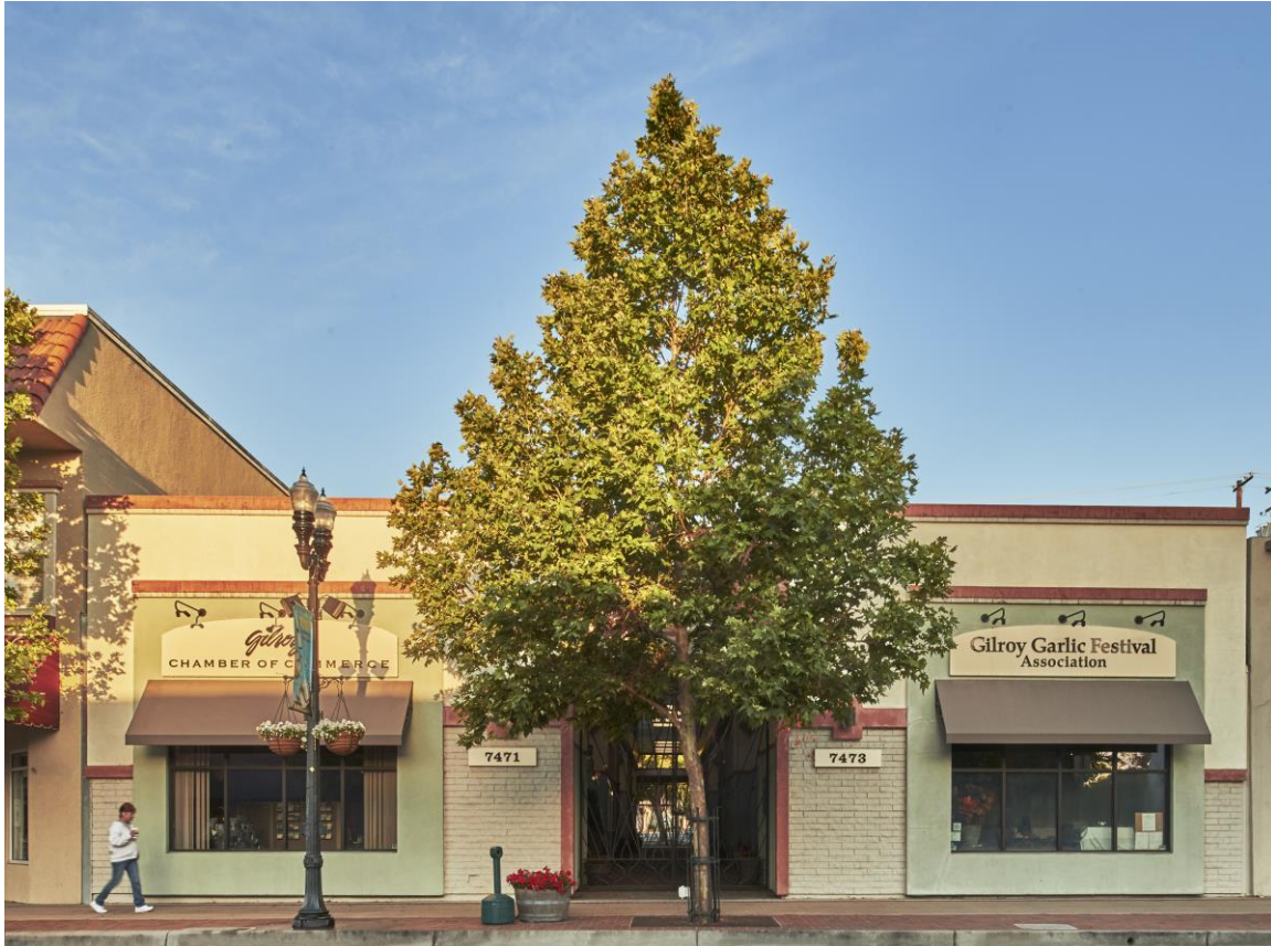
7471 and 7473 Monterey St., commendation for stylish updating downtown