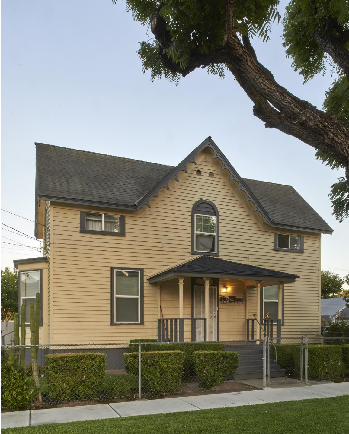
7311 Alexander Street, pioneer style moved in from a ranch east of town