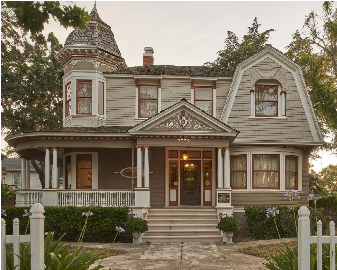
The Holloway House, Queen Anne Victorian, 1903 7539 Egleberry St., restored National Register home,